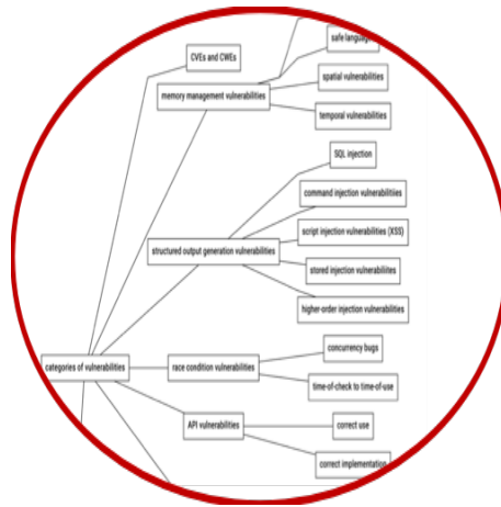
Figure 3: CyBOK Knowledge Tree